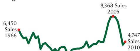
Figure 3. Texas Land Market Volume, 2010